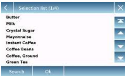
Internal database of products/processes