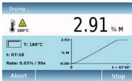
Drying cycle page with graph, with parameters