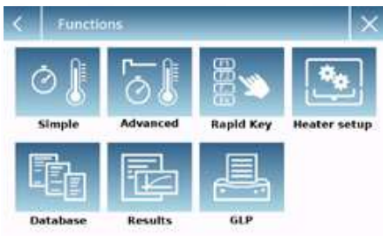
Main functions page for easy working