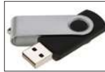
Export/import results and database to USB