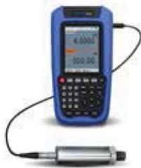
Additel 223A with ADT160A Pressure Module