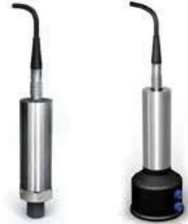
Gauge pressure Differential pressure